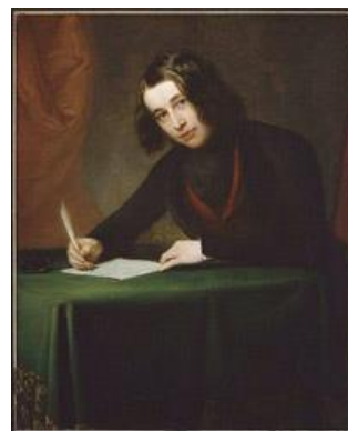
Charles Dickens (1842)