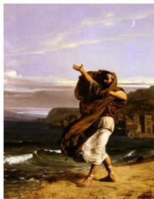
Demosthenes Practising Oratory (1870)

This Project is something with which you should be able to have fun .